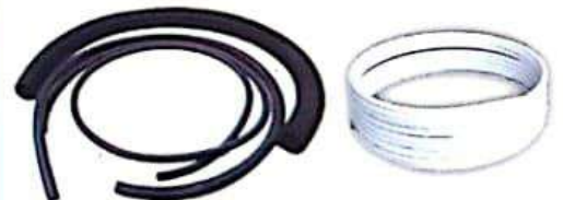
Low Pressure Pipe / High Pressure Pipe