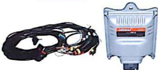
Electronic Control Unit (ECU)