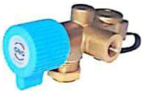
CNG Filler Valve